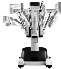
Da Vinci X